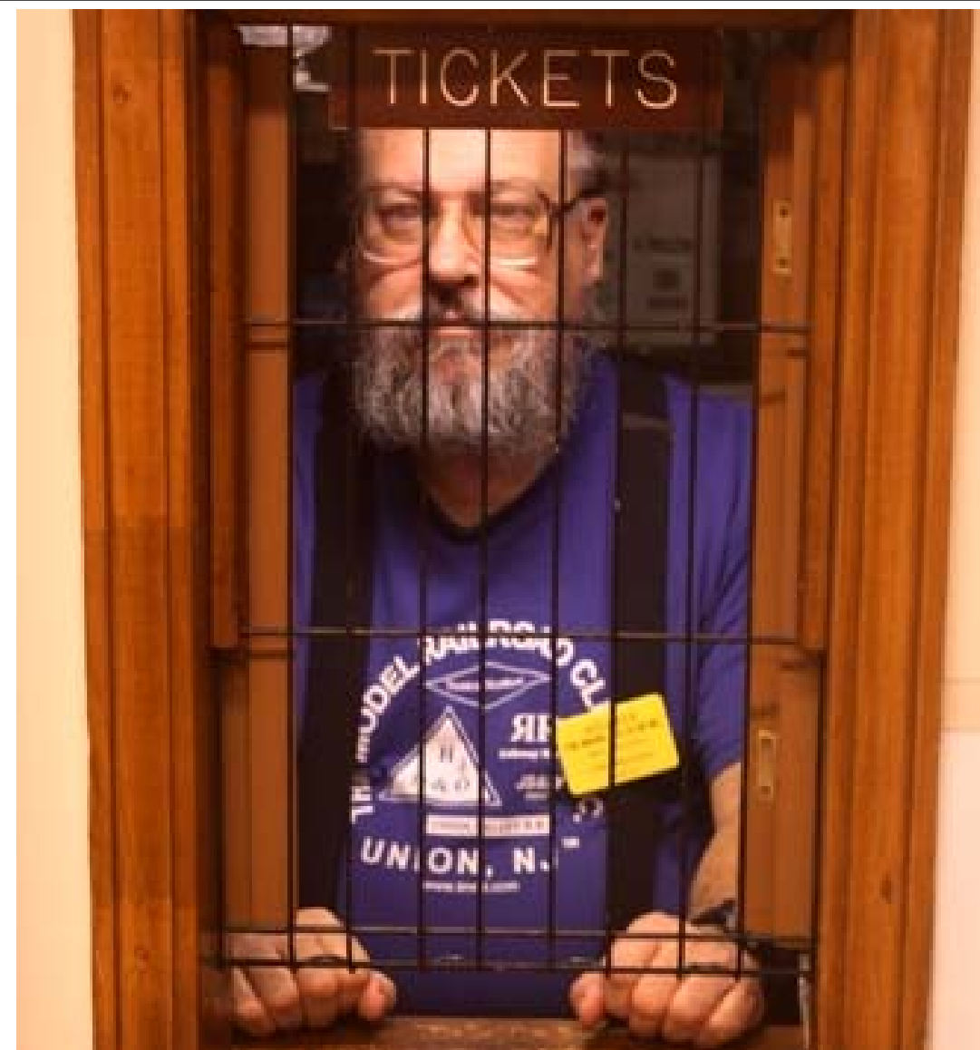
"That train doesn't leave for another forty-five minutes. That gives you enough time to catch the show upstairs."