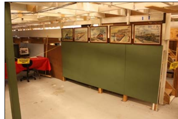
Spiffy clean up and redecoration job courtesy of Bob Nalbhone et al.