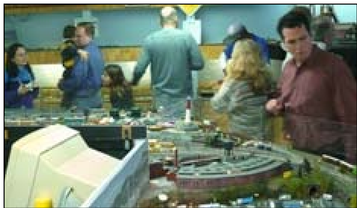
"Oo" and "ah" whispered over the N Scale layout with all the blinking lights and trains running.