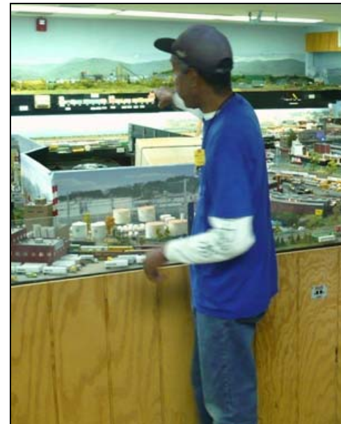
I think that I can fit some more lights in over there.