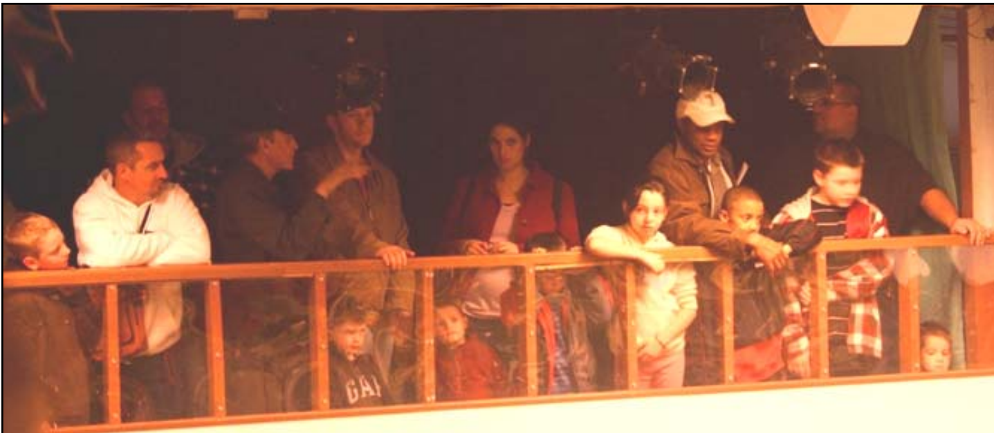
The crowds wait patiently for the show to begin on our first weekend for the show.