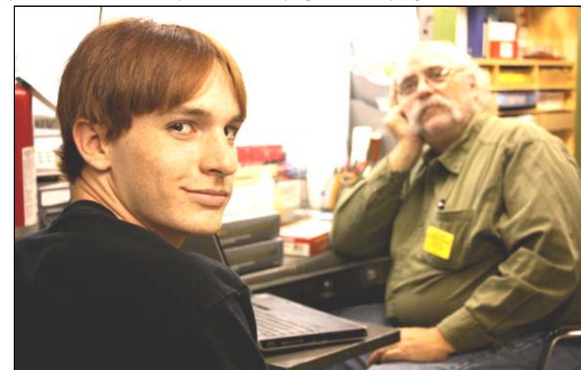
Honestly, He thinks I believe everything he tells me.