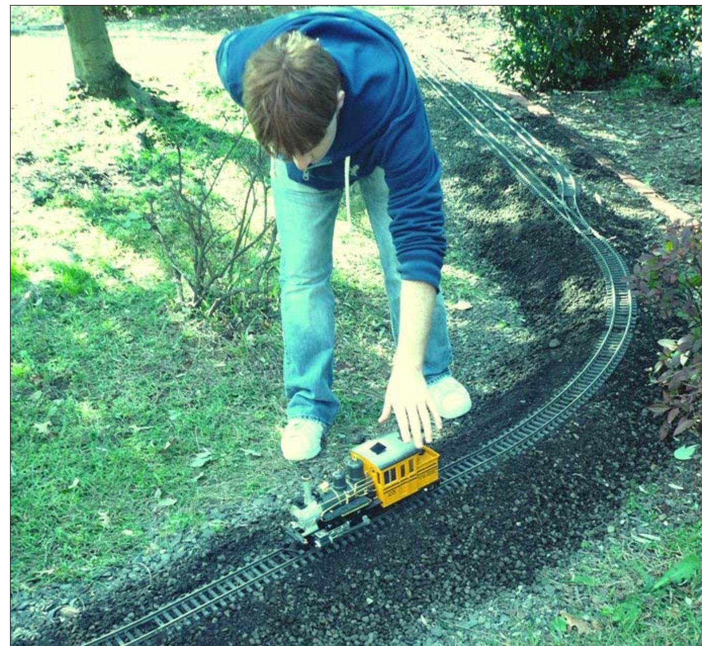
After much work Brian Cicero runs a Forney on the Garden Railroad layout!