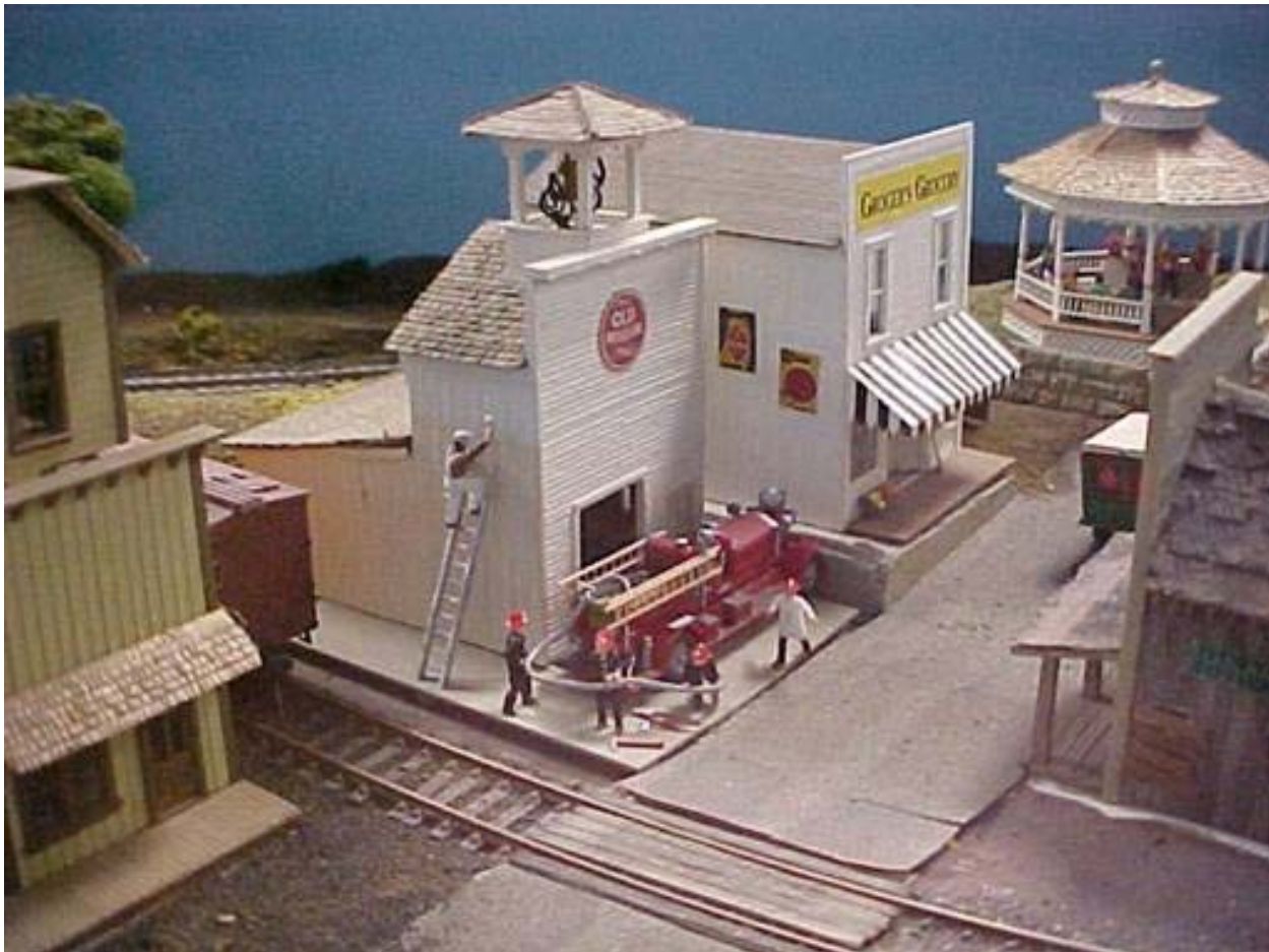
"Paintin' the Town White"

Well, that's all for now. See you next month.