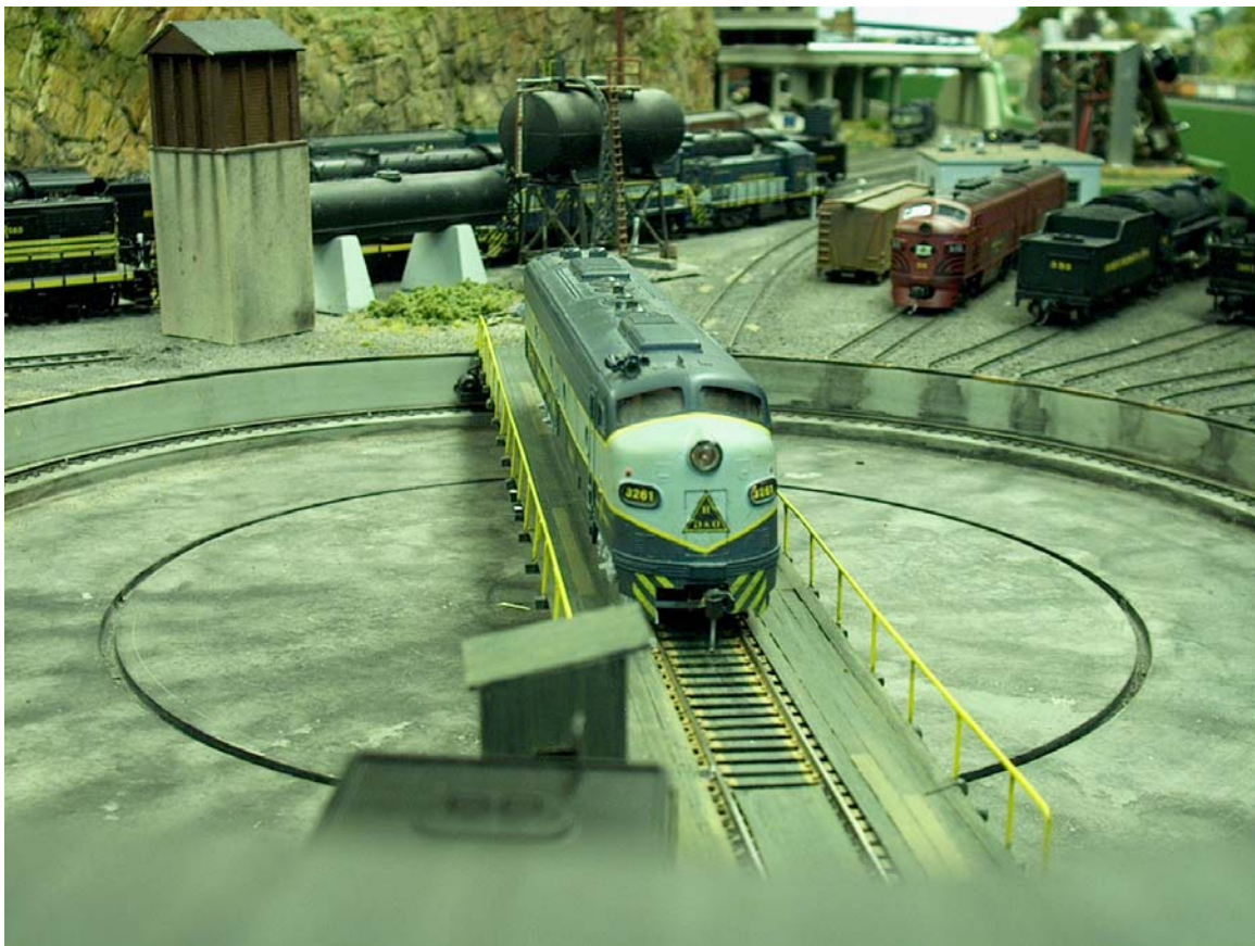
HD&O E-8 number 3261 takes a spin on the Pittsburgh turntable in between assignments.