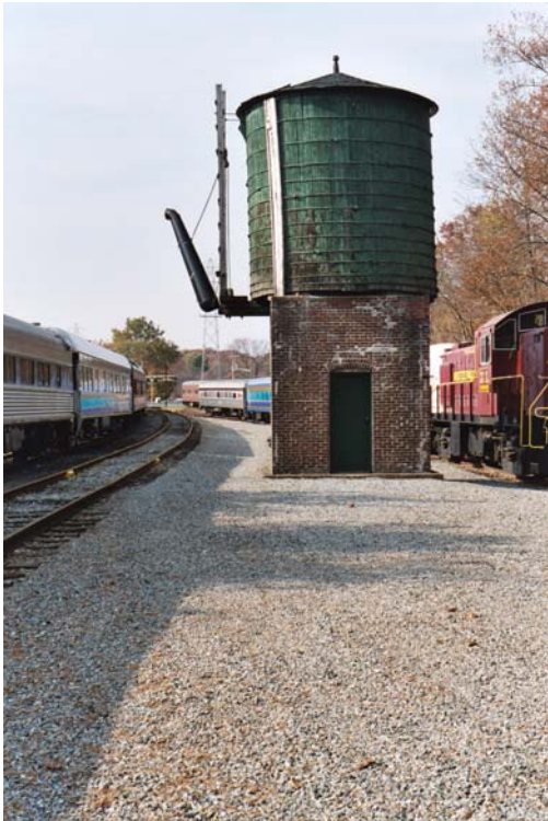
LEFT: Water tank located at the Whippany Railroad Museum, along the Morristown & Erie Railway in Whippany, NJ.