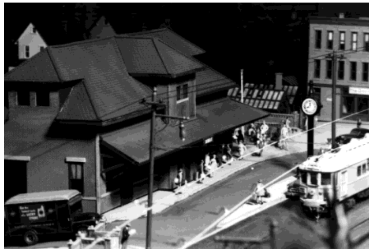
Trenton Northern Combine 501 stops at Reading Station, Trenton

The Rahway River Railroad is a shortline railroad operating between the towns of Kenilworth, Summit and Allentown. Customers are served on an as needed basis and given a level of service not seen on larger railroads. In the next section the Rahway River will serve a steel mill along its line.